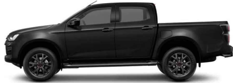
ONYX BLACK MICA