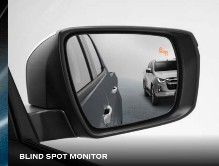
BLIND SPOT MONITOR