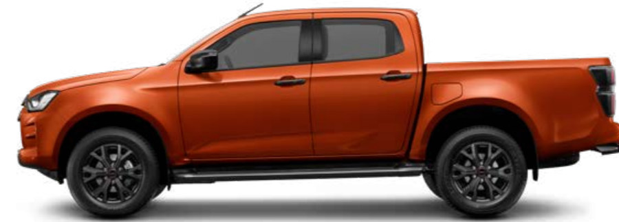
VALENCIA ORANGE METALLIC