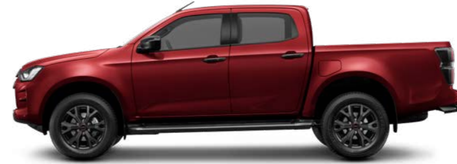
SPINEL RED MICA