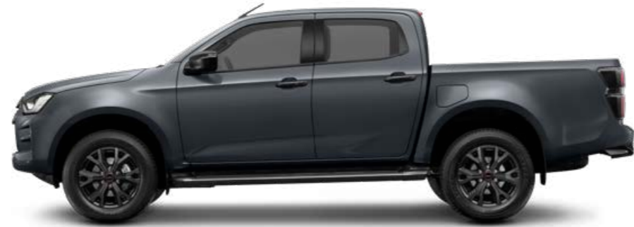
OBSIDIAN GREY MICA