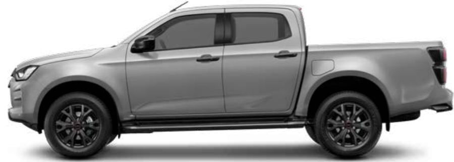
MERCURY SILVER METALLIC