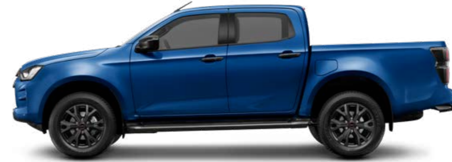
NEW BIARRITZ BLUE MET