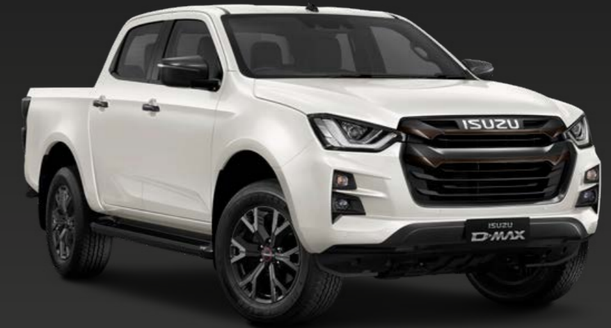
NEW DOLOMITE WHITE PEARLESCENT