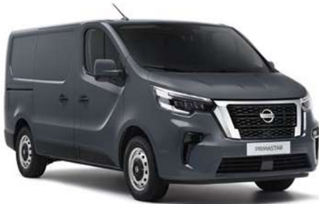
Urban Grey - S GRU/KPW