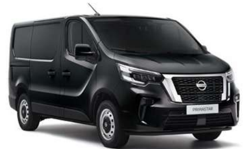
Jet Black - M BLK/D68