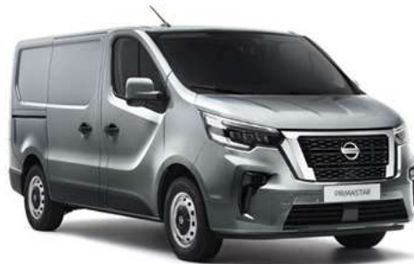
Stone Grey (1) - M GHG/KQA