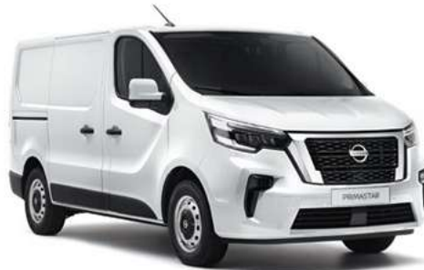
Glacier White - S WHI/369