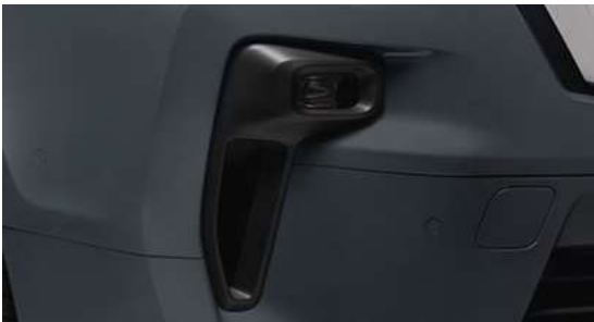
Side vents with LED fog lamps

Features available depending on version and grade, as standard or only as option (at an extra charge)