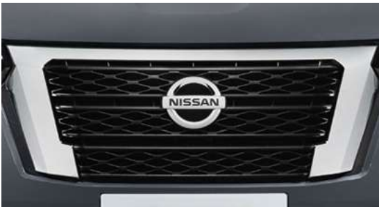
Distinctive Interlock-grille design