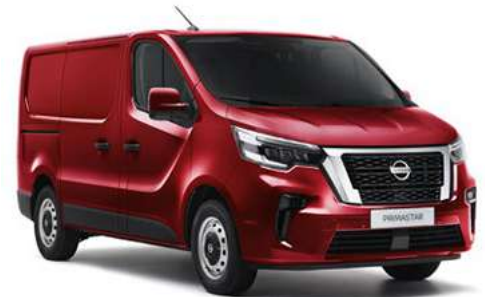
Carmin Red* - M RCM/NPF